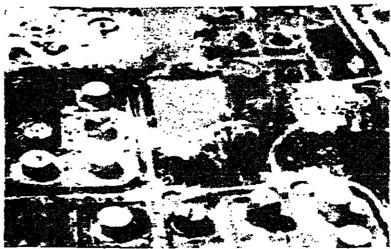
U.S. Air Force photograph shows burnt-out and damaged fuel tanks in a Hanoi depot after U.S. air strike with laser-guided bombs.

Although Franco-American differences over Vietnam policy were reported at the time, the documents